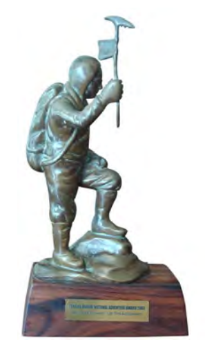
Fig. 13.7: TNNA Award