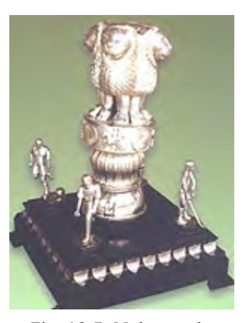
Fig. 13.5: Maka trophy