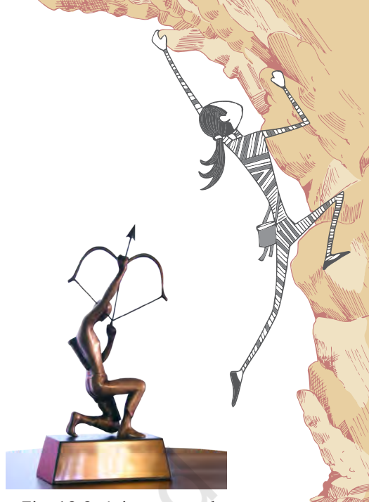
Fig. 13.3: Arjuna award

Government instituted MAKA Trophy in 1956-57 as a tool for promoting the competitive sport amongst colleges and Universities. The top overall performing University in the Inter-University tournaments in India is given the MAKA Trophy, which is a rolling trophy along with cash prize. The cash prize has also been recently enhanced to Rs.10 lakh, Rs. 5 lakh and Rs.3 lakh for the Universities securing first, second and third position respectively in Inter-University tournaments.