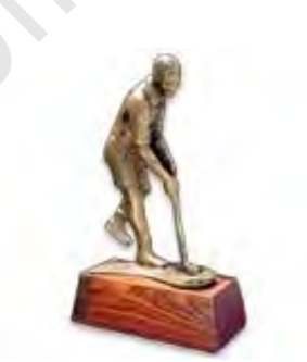
Fig. 13.4: Dhyan Chand award